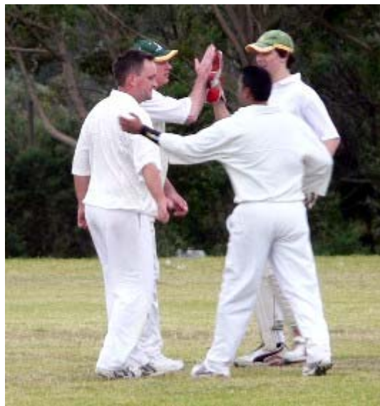
Wicket celebrations for the Skipper