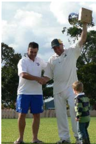
The Skipper with the Premiership trophy

Lane Cove 119 (Greg Brown 6/54, Niraj Pathak 3/36)