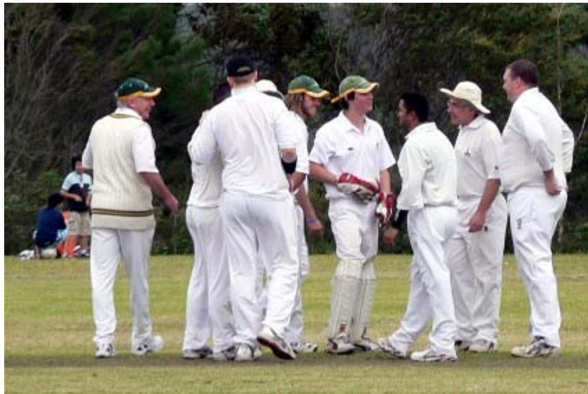
5 th Grade celebrate a wicket