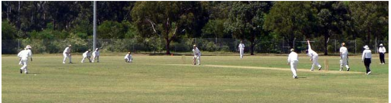
2 nd Grade in action on the Northern Oval

The frustration of the season was perhaps best reflected in our statistics (most notably percentage) that should have ensured us a place in the finals and the chance of higher honours. Rather than dwell on the results (still a sore point) I'll talk of the performances.