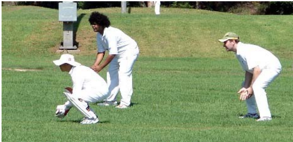
The 6 th Grade cordon waiting for an edge