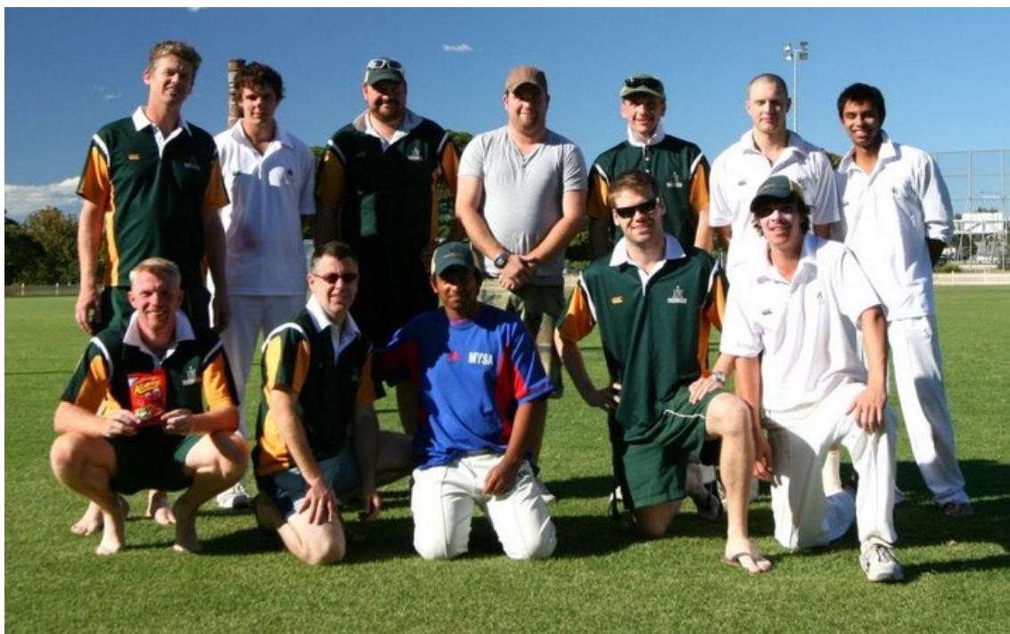
3 rd Grade Semi-Final Team