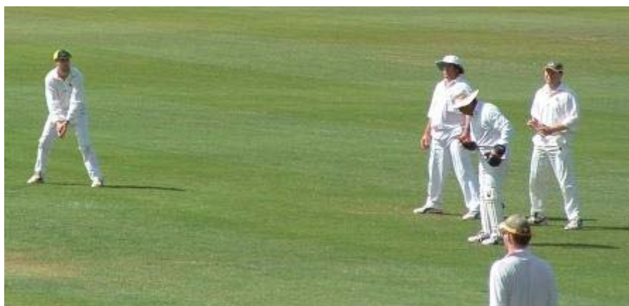
The 3 rd Grade Cordon during their Semi-Final