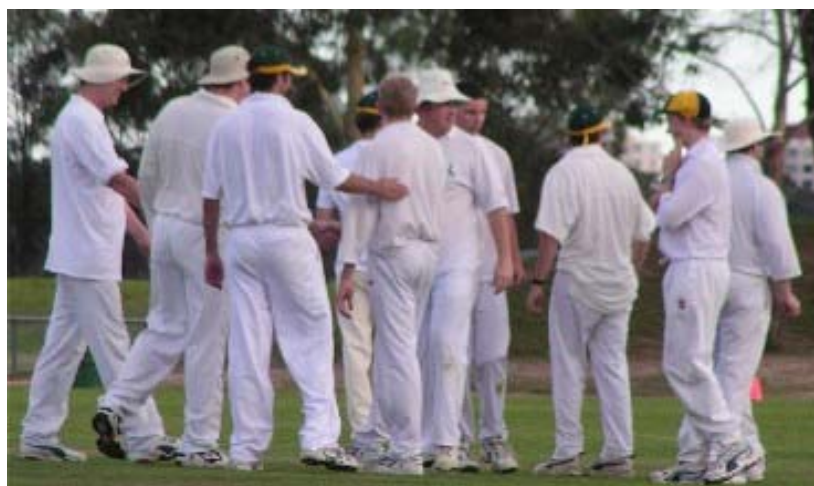
4 th Grade celebrating another wicket