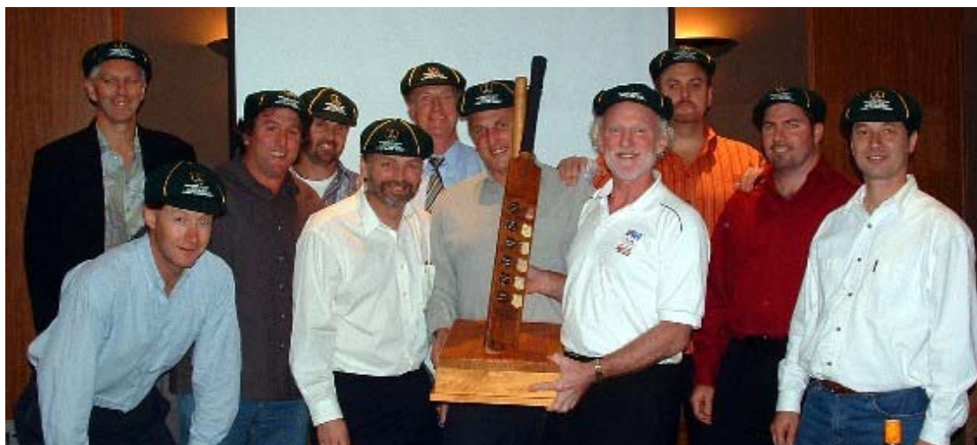
The victorious MUCC Undefeated Sydney Masters Premiers

A slightly anticlimatic end to the season. With the Premiership wrapped up MUSA cancelled our ground booking. The clean sweep was denied, but our disappointment of not playing was short lived. Undefeated Premiers has a really nice ring to it!