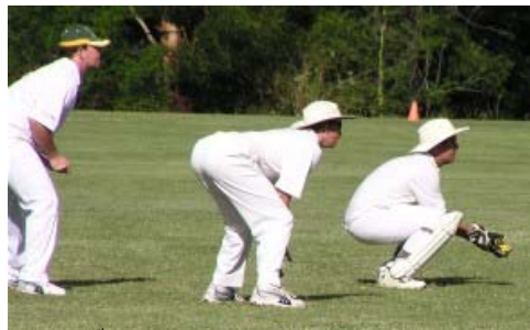
5 th Grade cordon wait for the chance