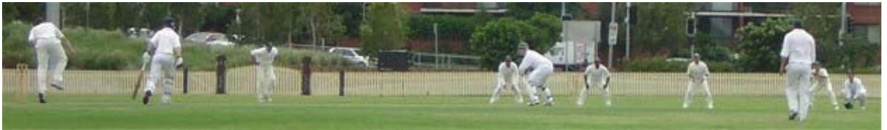
Steve Moran faces up to Travis Friend (vs South Sydney)

A disappointing effort from Macquarie saw us effectively 2 for minus 86 at the end of the first day. Our first innings was completed after just 35 overs, with Ying the top-scorer with (13). Bowling was going to be tough enough with such a small total to defend, and we didn't make it a whole lot easier on ourselves. Clifty bowled well to get (3/47). Resuming at 2/27 on day two it was always going to be a difficult day for MU. The resistance came from Lloyd (25) and Shrek (69). Souths then had 30 something overs to score 48 runs for outright points. Being realistic we set ourselves the target of four wickets. Maybe the captain should have asked for 10 as we did exactly that. Hoppa got 2, FB 1 and Clift came on for an over and got 1- an elusive stumping by Yinga, who managed to get more than his chest to a leg-side delivery.