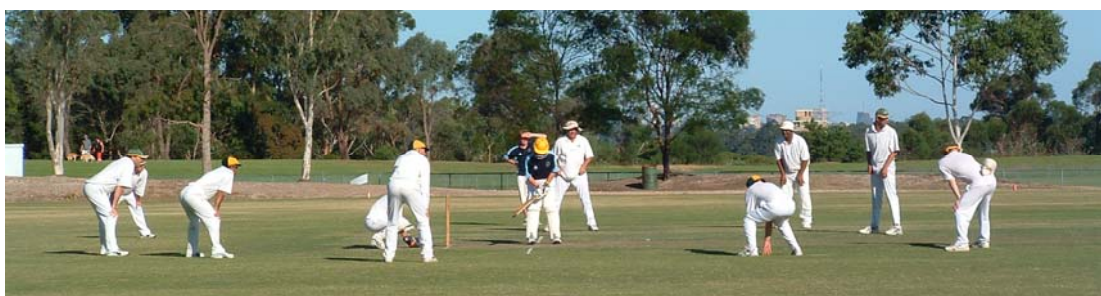
The 3 rd Grade team looking for another wicket